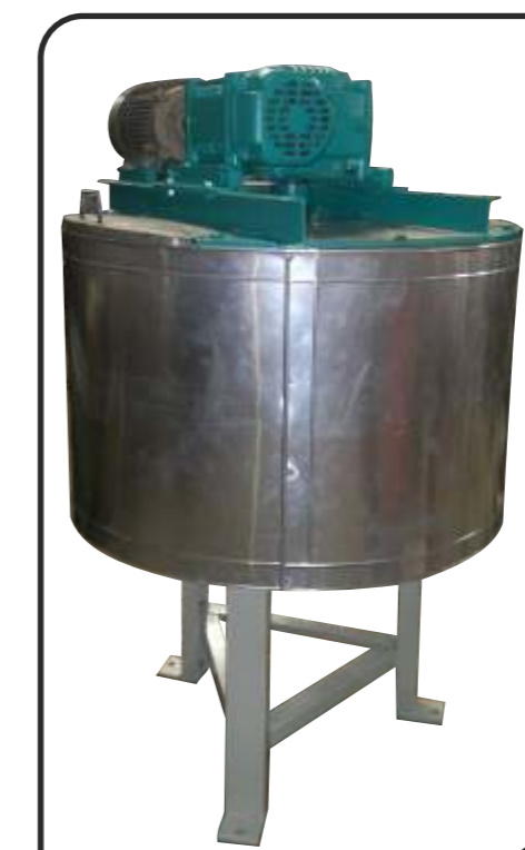
gum cooking pan slow speed stirrer