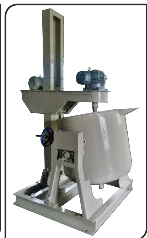
gum cooking pan with high speed stirrer